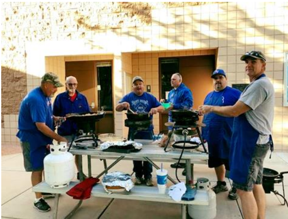
CVMS Teacher In-Service with Breakfast! Thank You Teachers for all you do!!