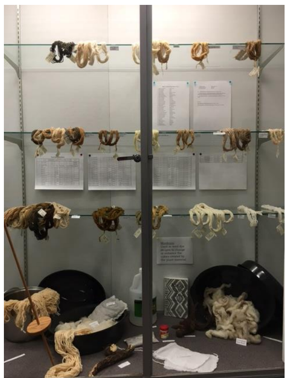
Our bulletin boards are decked-out: