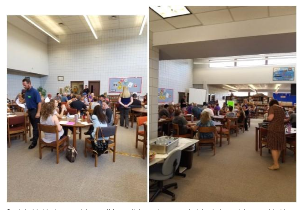
On July 26-28, the remaining staff from all three sites attended the 3 day training provided by the Flippen Group of CKH.