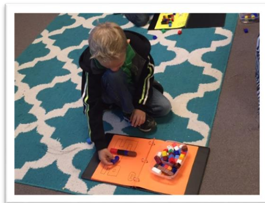
Sounding out words using Reading Horizons techniques Building site words using Unifix Cubes